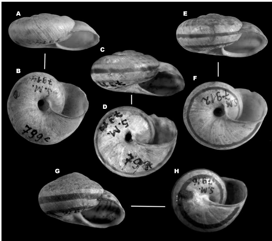
Fig. 1. A–B. Lectotype of Iberus guiraoanus (SMF 7914/2; 27.75 mm Ø); C–D. Lectotype of I. angustatus (SMF 7911; 21.8 mm Ø; phot. S. Hof, Naturmuseum Senckenberg); E–F. Paralectotype of I. angustatus (SMF 7912; 22.2 mm Ø); G–H. Lectotype of I. alcarazanus (SMF 7916/2; 22.7 mm Ø).

Fig. 1. A–B. Lectotipo de Iberus guiraoanus (SMF 7914/2; 27,75 mm Ø); C–D. Lectotipo de I. angustatus (SMF 7911; 21,8 mm Ø; phot. S. Hof, Naturmuseum Senckenberg); E–F. Paralectotipo de I. angustatus (SMF 7912; 22,2 mm Ø); G–H. Lectotipo de I. alcarazanus (SMF 7916/2; 22,7 mm Ø).